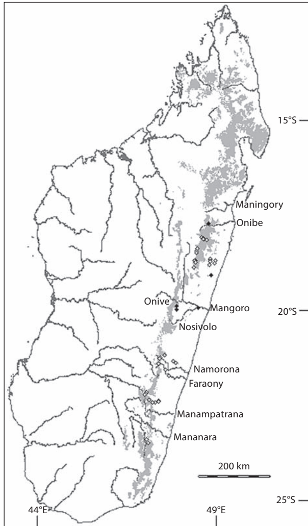
Fig. 3. Map of Madagascar showing survey sites where we found evidence of P. simus during this study (black diamonds), previous records of P. simus (white diamonds), approximate rainforest cover (light grey) and large rivers (dark grey, with names for those within the range of P. simus ). Previous P. simus records include those given by Meier and Rumppler [1987], Andriaholinirina et al. [2003], Wright et al. [2008], Delmore et al. [2009], Rajaonson et al. [2010], Ravaloharimanitra et al. [2011] and Rakotonirina et al. [in press].

increasing the area of its possible extant range. However, within this expanded potential range, evidence suggests that the species is very patchily distributed, and it appears to be absent from many sites supporting apparently suitable habitat and the grey bamboo lemur H. griseus [Rajaonson et al., 2010; Ravaloharimanitra et al., 2011]. Many of these lowland sites, therefore, appear to support small isolated populations which are unlikely to be viable and are probably at a high risk of extinction. Further research is urgently required to ascertain the true level of isolation of these lowland sites, the consequent impacts on the viability of the populations at these sites and the implications for the effective total population size of the species in the wild.