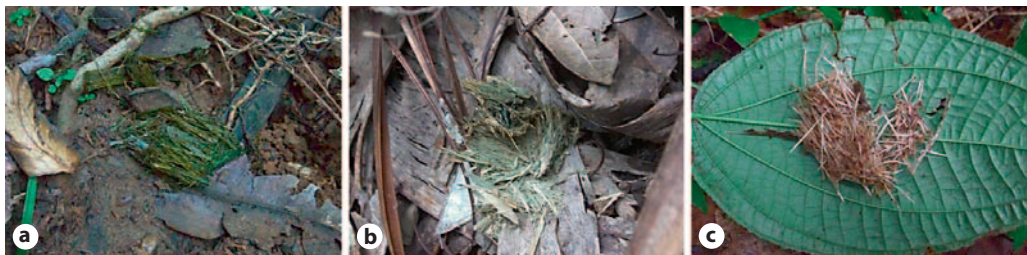
Fig. 2. Faeces of P. simus from Vohibe (a), Mahalina (b) and Zahamena (c).

Bamboo sp. 1 = V. diffusa ; Bamboo sp. 2 = C. madagascariensis ; Bamboo sp. 3 = unidentified species known locally as 'Volojatsy' or 'Volo lagnana'.