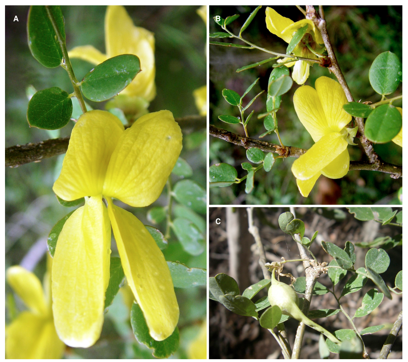
Fig. 2. – Ormocarpopsis anosyana Thulin & Razafim. A. Front view of flower; B. Flowering branch; C. Fruiting branch, showing fruit with a single seed developed.