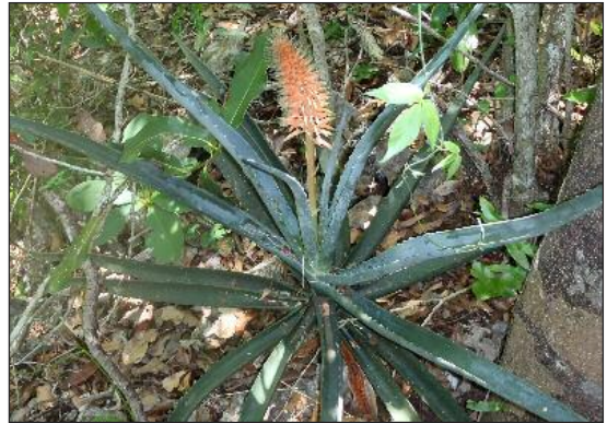
Figure 8. Aloe namorokaensis from northwestern Madagascar is a Data Deficient species that is only known from the type locality.

Data from a total of 1630 collections were assembled and compiled into a Botanical Research