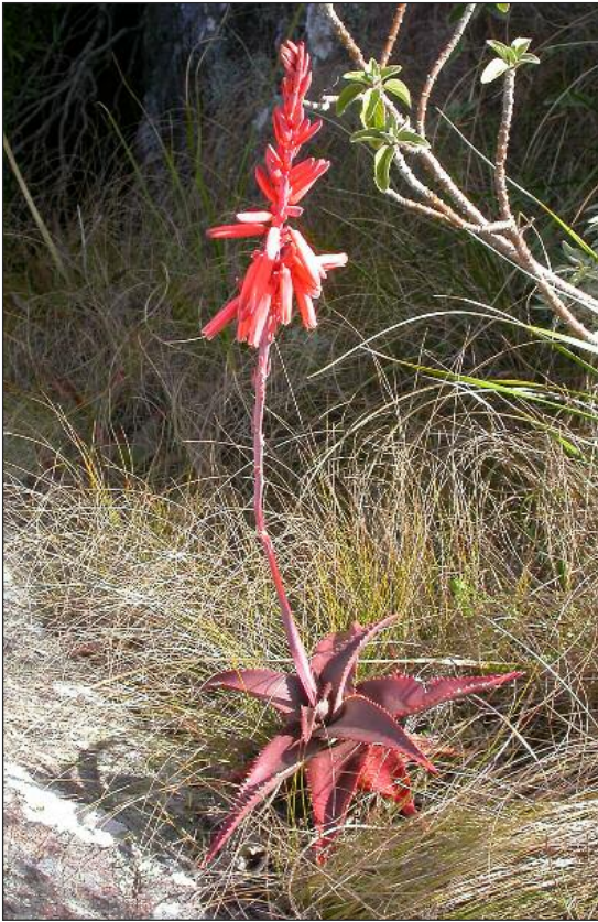
Figure 7. Aloe madecassa is endemic to the Antananarivo region in east-central Madagascar and is here assessed as Vulnerable.