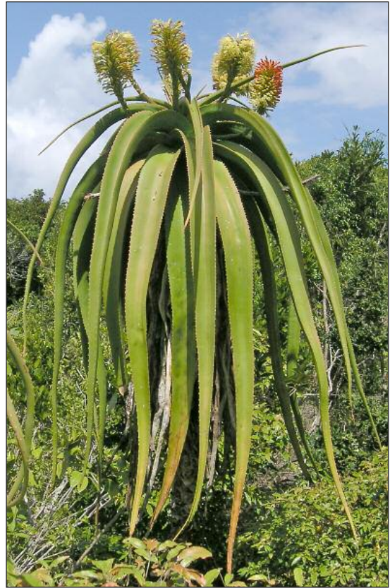
Figure 2. Aloe helenae from southeastern Madagascar is currently listed as Critically Endangered on the IUCN Red Data List.