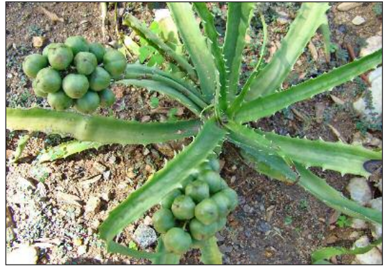
Figure 6. Aloe ivakoanyensis is a berried aloe described in 2012 from the Ivakoany Massif in southeastern Madagascar and was assessed as Critically Endangered at the time.

To assemble all the necessary data from herbarium collections, visits were made to various herbaria including the National Herbarium, Pretoria (PRE), and those of the Botanical and Zoological Park of Tsimbazaza (TAN) and the Royal Botanic Gardens, Kew (K). For those herbaria where important Malagasy specimens are held and that could not be visited, available data were downloaded through the Global Biodiversity In-