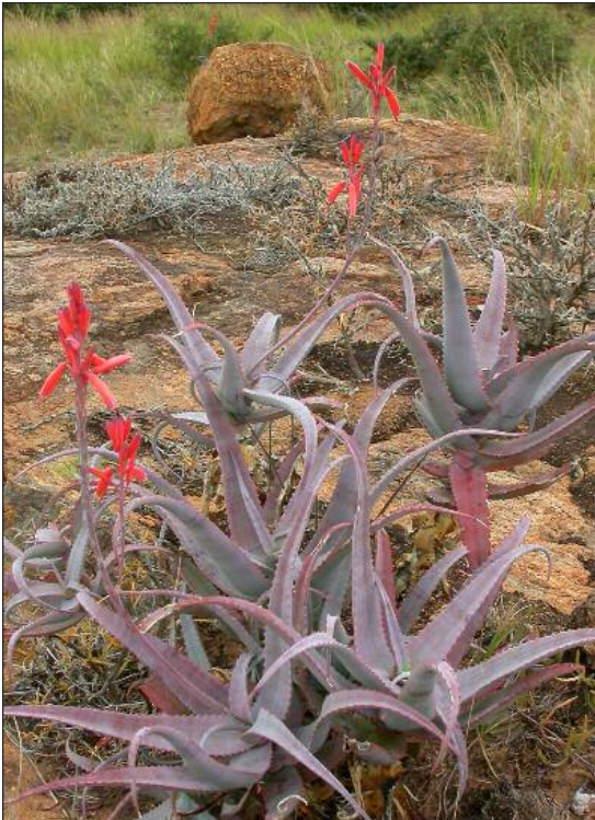
Figure 9. Aloe newtonii from south-central Madagascar is named after Prof. Len Newton. It is here assessed as Endangered.

owing to several factors, but the most common is the fact that few botanists collect aloe material as it demands more preparatory treatment and takes a lot of time to make proper herbarium specimens of these fat-leaved plants. A total of 69% of Madagascan aloes in the DD category are only represented by the type specimen. These include taxa that have been newly described since the 1990s and also a few that have not been collected for more than 100 years. The remaining DD aloes are known from only one or two localities and CAT are thus unable to calculate EOO and AOO values. For the first group, the DD status can easily be explained by their recent discovery and the fact that only a few collections have been made since. However, the problem remains for aloes that were described long ago, but where collection numbers are two or less. These taxa might be very rare, extinct in the wild or access to the populations is very difficult [e.g. Aloe prostrata (H.Perrier) L.E.Newton & G.D.Rowley].