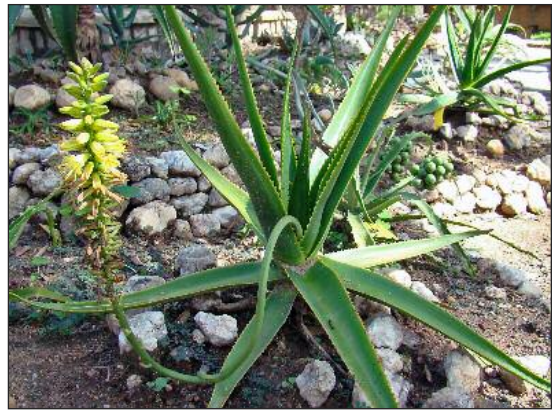
Figure 4. Aloe bernadettiae from southeastern Madagascar is a Data Deficient species that used to be common, but has now seemingly become scarce.

All species of Aloe [except for A. vera (L.) Burm.f] appear on the Appendices of the Convention on the International Trade in Endangered Species of Wild Fauna and Flora (CITES). This means that trade in aloes is controlled to prevent utilisation that would be incompatible with their survival. Of the 21 aloe species listed on Appendix I (CITES, 2014), a total of 17 are Malagasy species. This is an indication of the huge threat