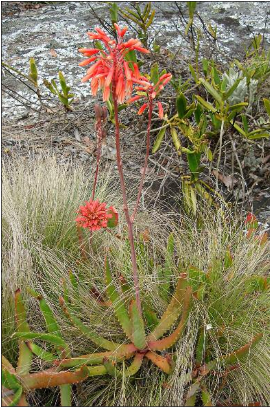
Figure 5. Aloe hoffmannii from central Madagascar is only known from the area of its type locality and is assessed here as Critically Endangered.