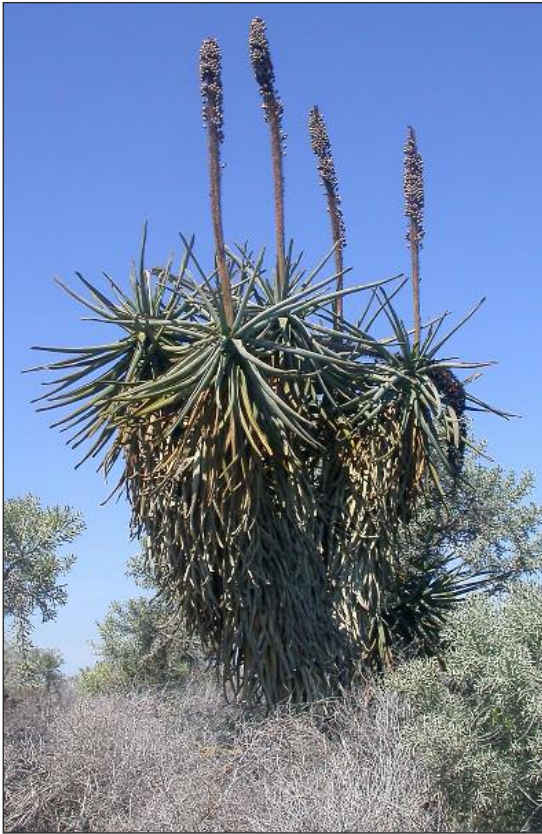
Figure 1. Aloe suzannae from southern Madagascar is one of only two Madagascan aloes currently included in the IUCN Red Data List. It is listed as Critically Endangered.

tersuchungen dieser "Data Deficient"-Taxa sowie umfassende Einschätzungen des Gefährdungsstatus' aller madagassischen Aloen. Diese Resultate ergeben die Grundlage für die Prioritätensetzung bei Schutzprojekten für Aloe sowie die Gegenden, in welchen sie vorkommen.