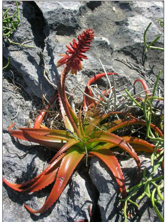
Figure 10. Aloe suarezensis from the Antsiranana region in northern Madagascar is the only Madagascan aloe with fine hairs on the flowers and pedicels. It is here assessed as Endangered.

The difficulty of assessing taxa with few specimens or only old material is a frequent problem and may be relevant to as much as 20% of the world's plant diversity. If all these taxa are assessed as DD, then the result would be a huge un-