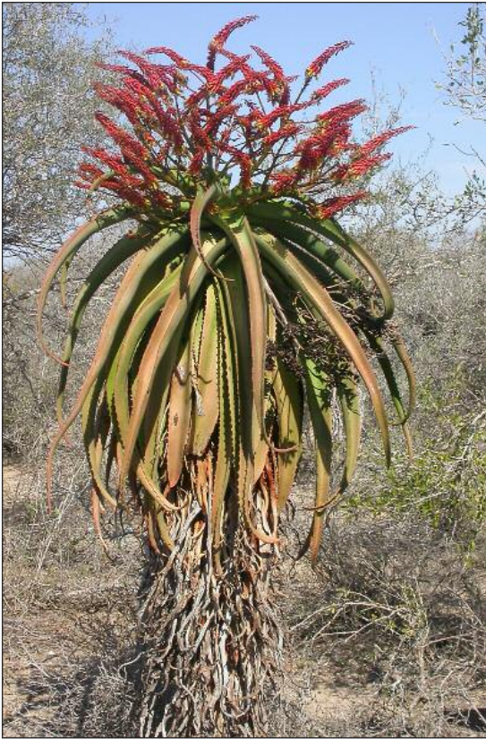
Figure 11. Aloe vaotsanda from southern Madagascar is here assessed as Vulnerable. The stems of this aloe are used in the construction of huts.