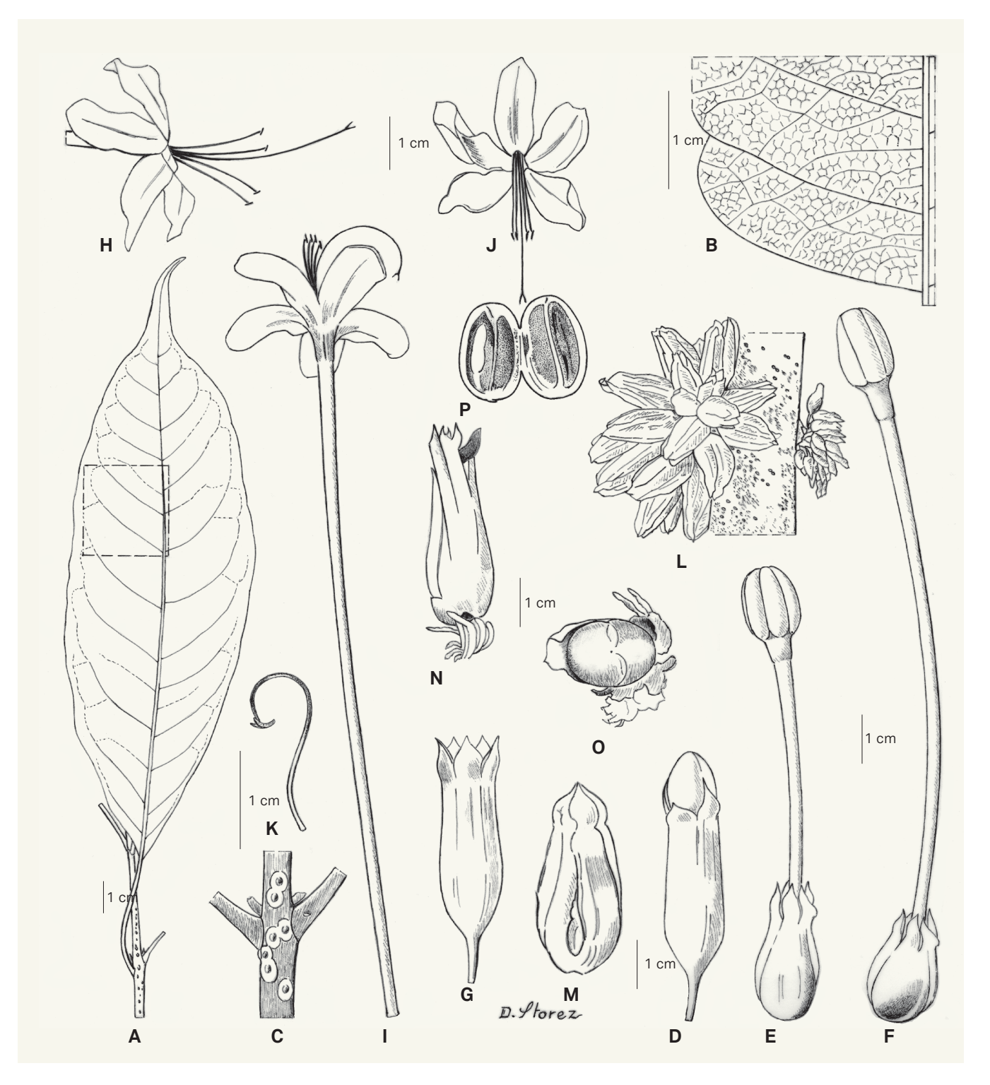
Fig. 1. – Line drawings of Clerodendrum kamhyoae Phillipson & Allorge. A. Leaf showing long attenuate-acuminate apex and arcuate secondary veins; B. Detail of secondary and tertiary leaf venation; C. Stem node showing lenticelles; D. Early flower bud with the corolla pushing open the sepals; E. Young flower bud with elongating corolla tube; F. Pre-anthesis flower bud; G. Mature calyx; H. Corolla seen from side (tube incomplete); I. Corolla seen from below; J. Corolla seen from front; K. Stamen with mobile anther thecae; L. Young inflorescences; M. Calyx surrounding an immature drupe showing an irregular split due to the expansion of the ovary; N. Part of infrutescence, with calyx enveloping immature fruit and pedicels of fallen flowers visible; O. Fruit with calyx removed to show the upper surface of the drupe; P. Longitudinal section of the ovary showing the two locules. [A-K: Allorge 2839, P; L-P: redrawn from photographs] [Drawings: D. Storez]