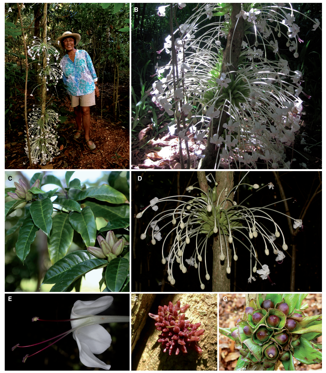
Fig. 2. – Photographs of Clerodendrum kamhyoae Phillipson & Allorge. A. Marie Hélène Kam Hyo Zschocke standing with a young flowering individual; B. Trunk with inflorescences; C. Young shoots bearing occasional terminal inflorescences; D. Young inflorescence showing pre-anthesis buds tinged dull purple-brown and open flowers; E. Bisected flower showing insertion of stamens; F. Young flower buds with caducous bracts visible; G. Developing fruits (upper part of calyx removed).